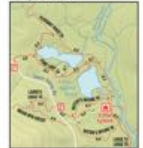
Gorman Chairback Area